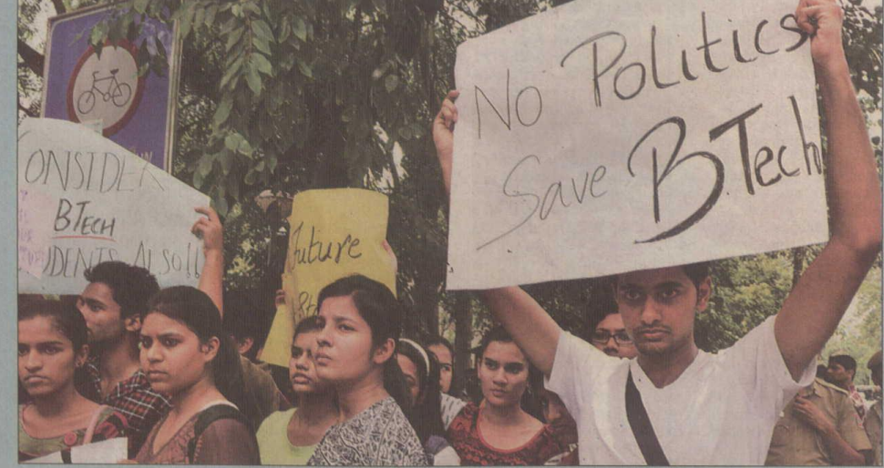
Hundreds of BTech students of DU colleges had, in June, 2014, demanded clarity on the validity of their courses.

If DU colleges do not apply for AICTE approvals within the deadline, they will have to wait for a year for the same