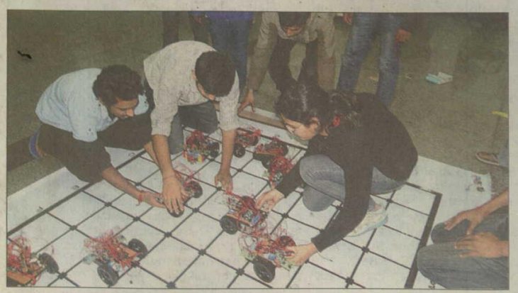
BTech students at the DU Cluster Innovation Centre workin on a project

Since course structure and name of the degree has been changed, the question is what degree will the outgoing batch be