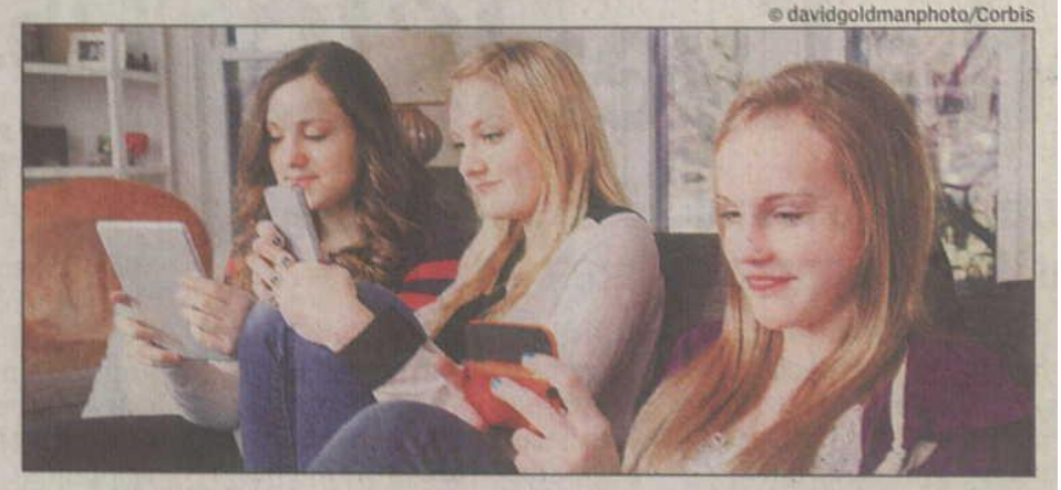
Those who used 2-3 devices were 50% more likely to sleep for less than 5 hours

Use of a computer, smartphone, or Mp3 player in the hour before